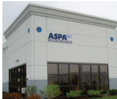
Our Offices at the Brewster Creek Business Park, Bartlett, Illinois

Services performed by experienced professionals in a cost effective manner.